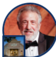
George Zimmer Founder, Men's Wearhouse